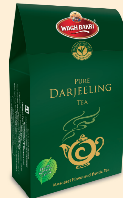
Wagh Bakri Pure Darjeeling Tea