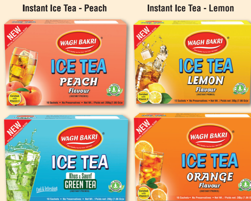
Instant Ice Tea Khus & Saunf - Green Tea